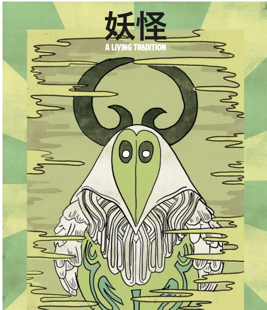
YOKAI - TENGU 1009795 27x17x14 cm 10 3/4 x 6 3/4 x 5 1/2"

Through lines, colors, and form, this particular Tengu offers a contemporary vision of an ancient and fascinating universe. A creation that bridges past and present through the language of design.