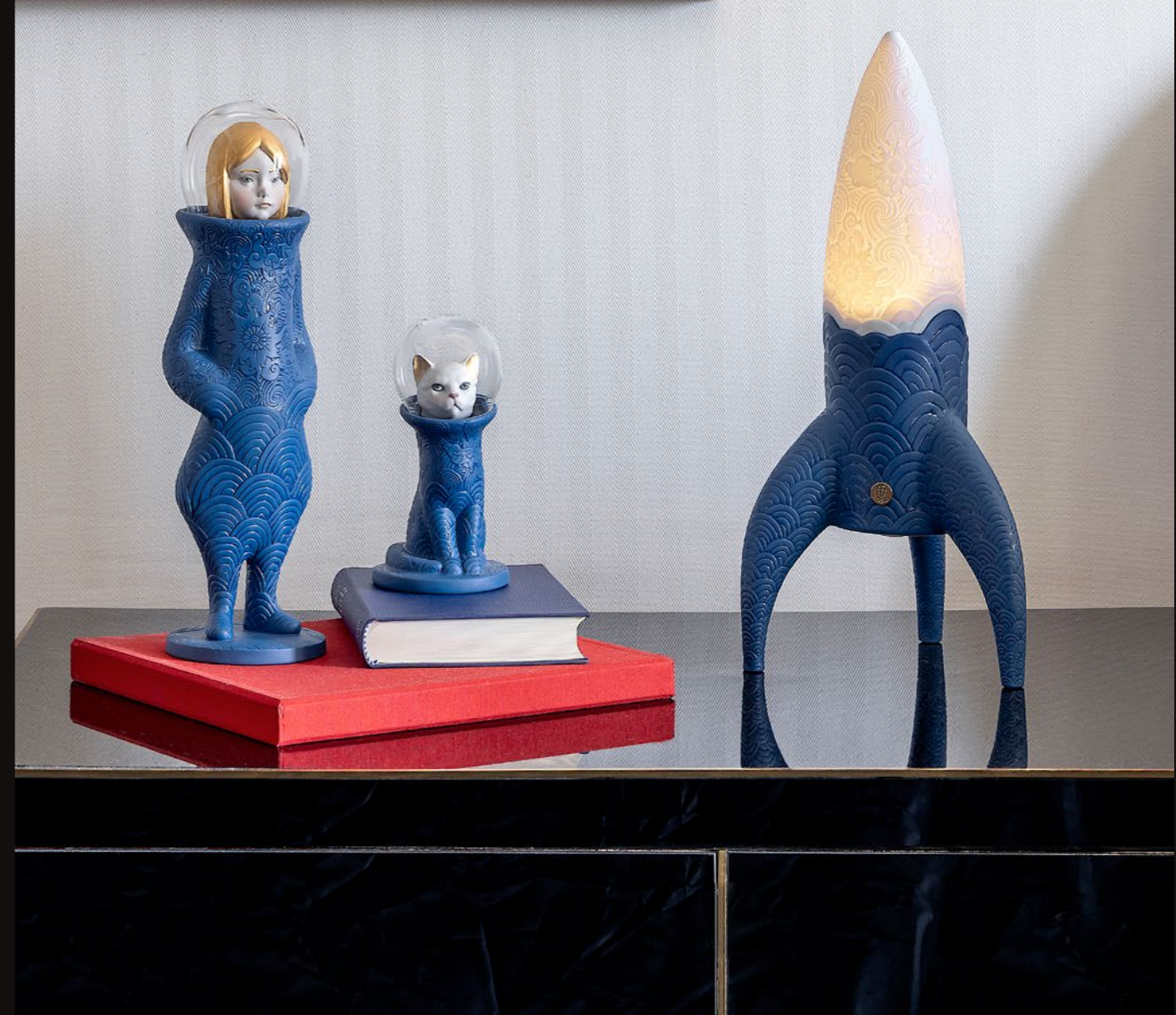
COSMIC ROCKET WIRELESS LAMP 01024459 40x18x18 cm 15 3/4 x 7 x 7"