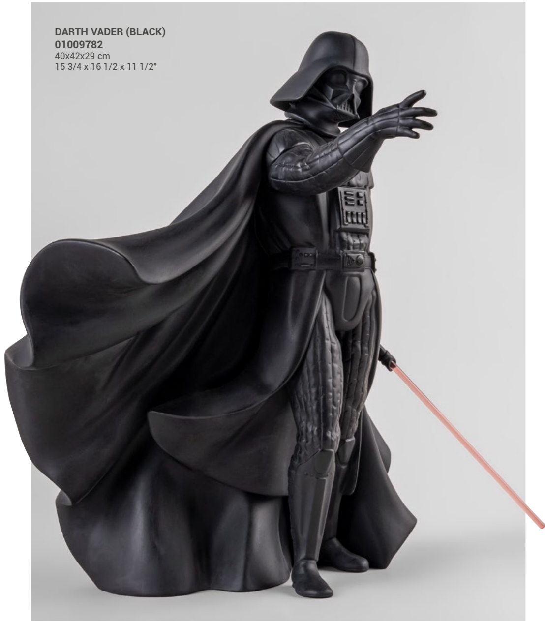
DARTH VADER (BLACK) 01009782 40x42x29 cm 15 3/4 x 16 1/2 x 11 1/2"

Inspired by the film saga that has influenced generations, Darth Vader™ embodies the dark side, the tension between power and redemption, and the magnetic presence of a character who transcends the screen. A must-have creation for Star Wars™ fans.