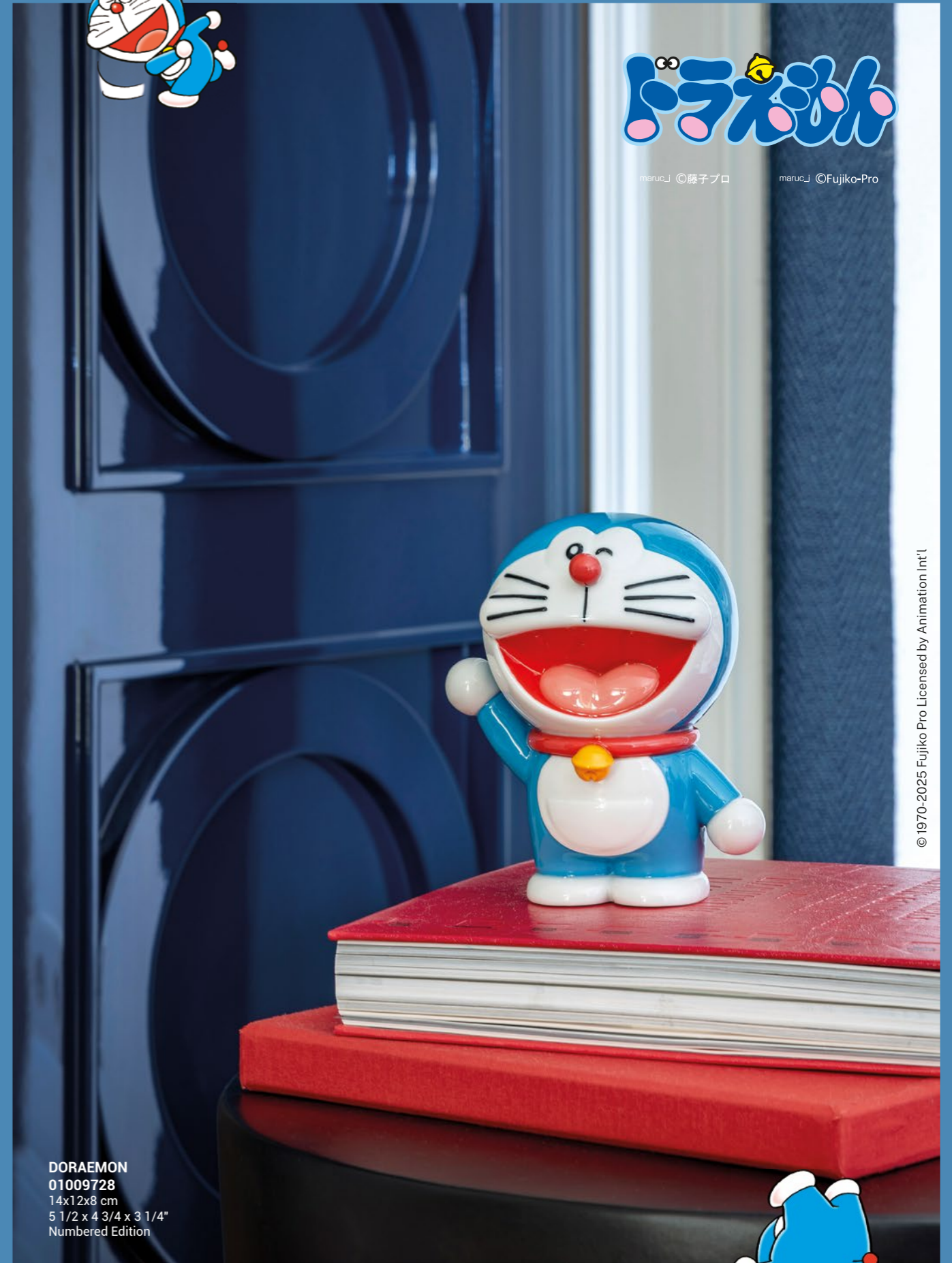
DORAEMON 01009728 14x12x8 cm 5 1/2 x 4 3/4 x 3 1/4" Numbered Edition

© 1970-2025 Fujiko Pro Licensed by Animation Int'l