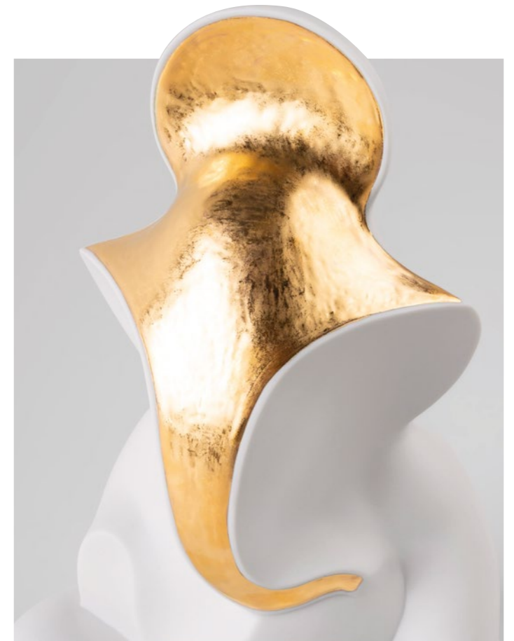
INDIA PREMIERE LORD GANESHA - ETERNAL LIGHT 01009804 26x18x14 cm 10 1/4 x 7 x 5 1/2"

Lord Ganesha is one of the most revered deities in Hinduism. He symbolizes wisdom, intelligence, and new beginnings. In this creation, we reinterpret his image through abstraction, applying a refined approach to both form and decoration. We establish a dialogue with tradition from a current perspective, connecting spirituality and design.