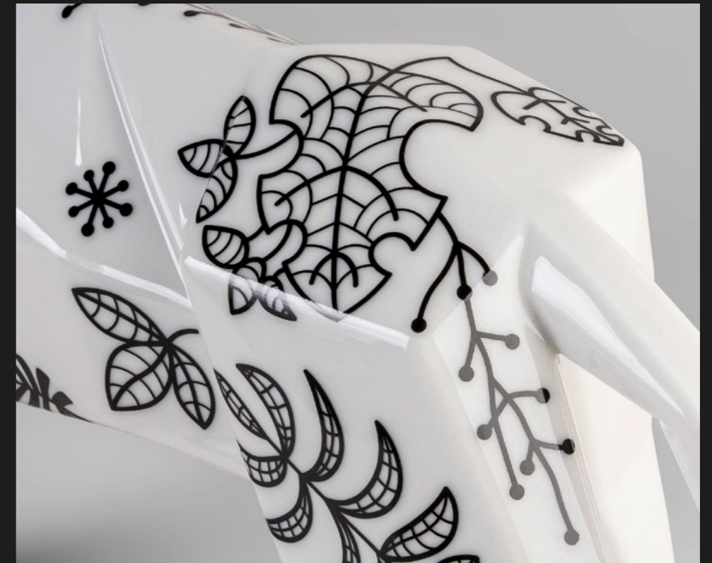
JUNGLE PANTHER BLACK 01009790 19x50x12 cm 7 1/2 x 19 3/4 x 4 3/4"

Reproducing a creation like this in porcelain, with its many angles and straight lines, poses an added challenge during the firing process. The natural shrinkage that occurs as the piece passes through the kiln affects this type of composition, as even the slightest variation can distort the sharpness of a line or the clarity of an angle. Unlike organic shapes, geometric structures require an extra level of control to ensure balance and precision. These are creations that, beneath their apparent formal simplicity, push the boundaries of handcrafted porcelain.