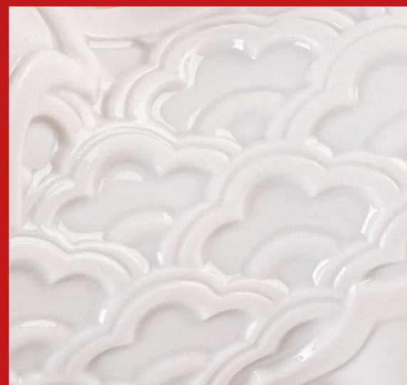
BABY HORSE 01009029 19x18x8 cm 7 1/2 x 7 x 3 1/4"