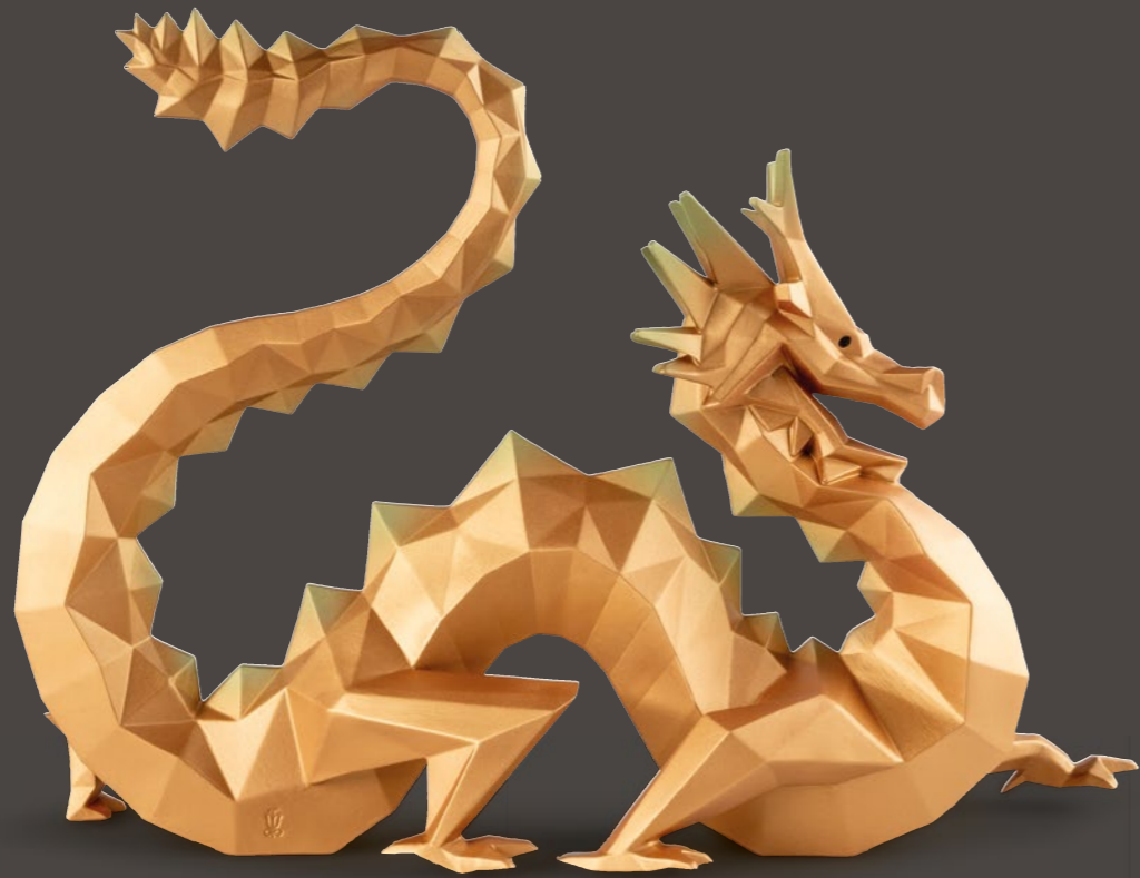
DRAGON (GOLDEN) 01009797 36x49x18 cm 14 1/4 x 19 1/4 x 7" Limited Edition of 888 units

This piece belongs to the Origami collection, a series of sculptures that reinterpret the animal world through geometric abstraction, with an aesthetic rooted in contemporary design.