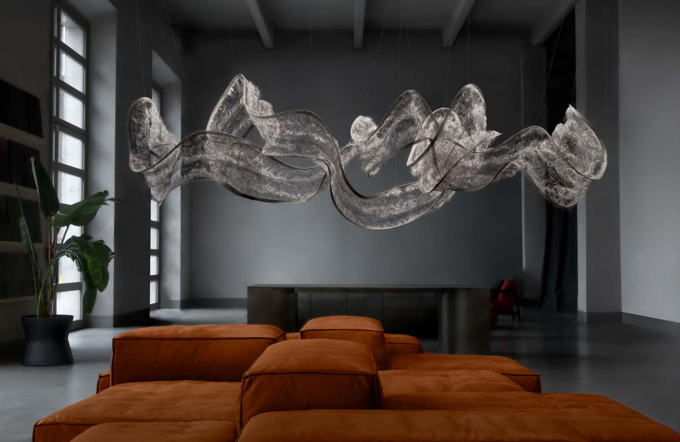
Genesis, floating knit