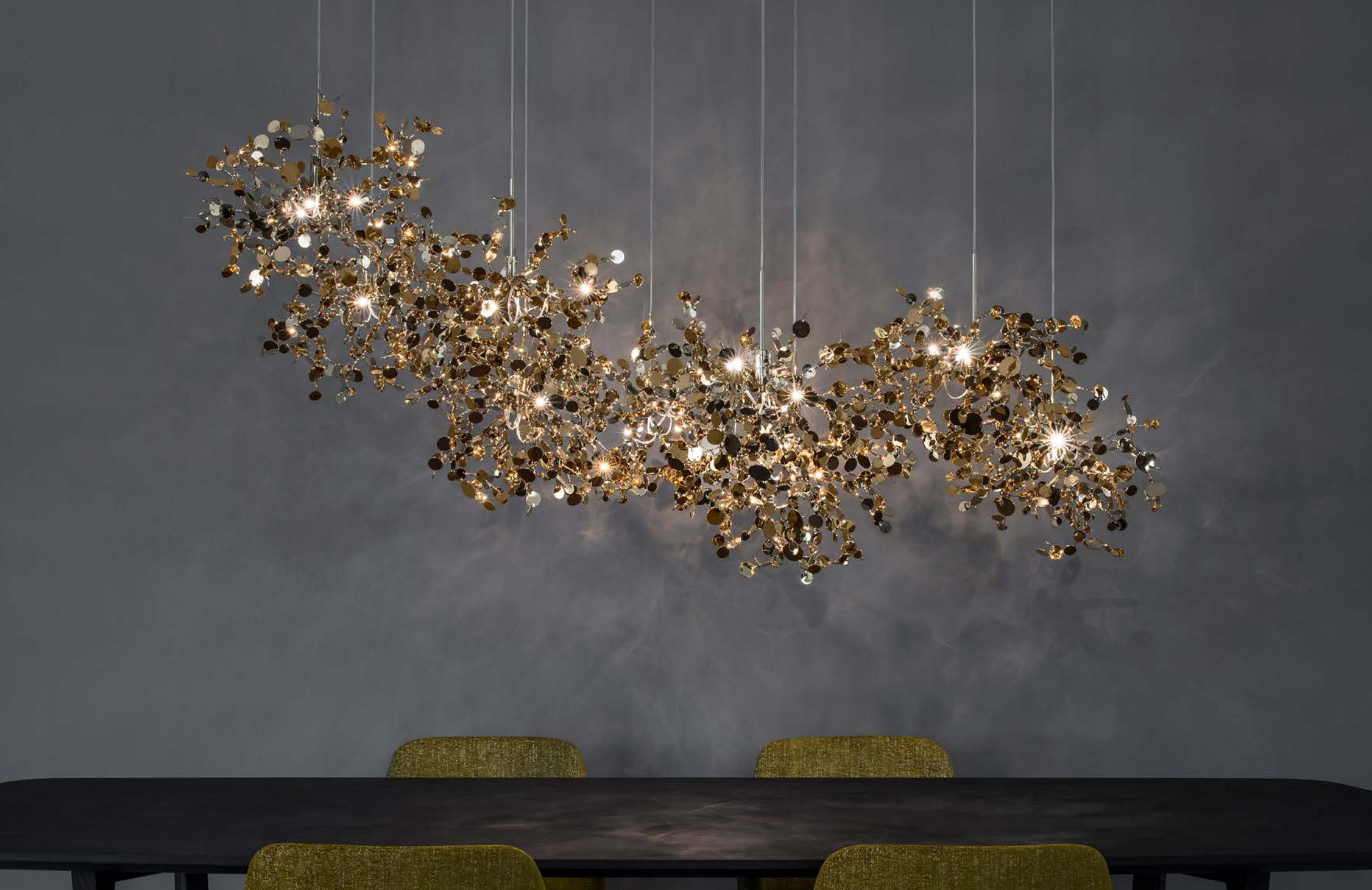
Argent, a precious cloud