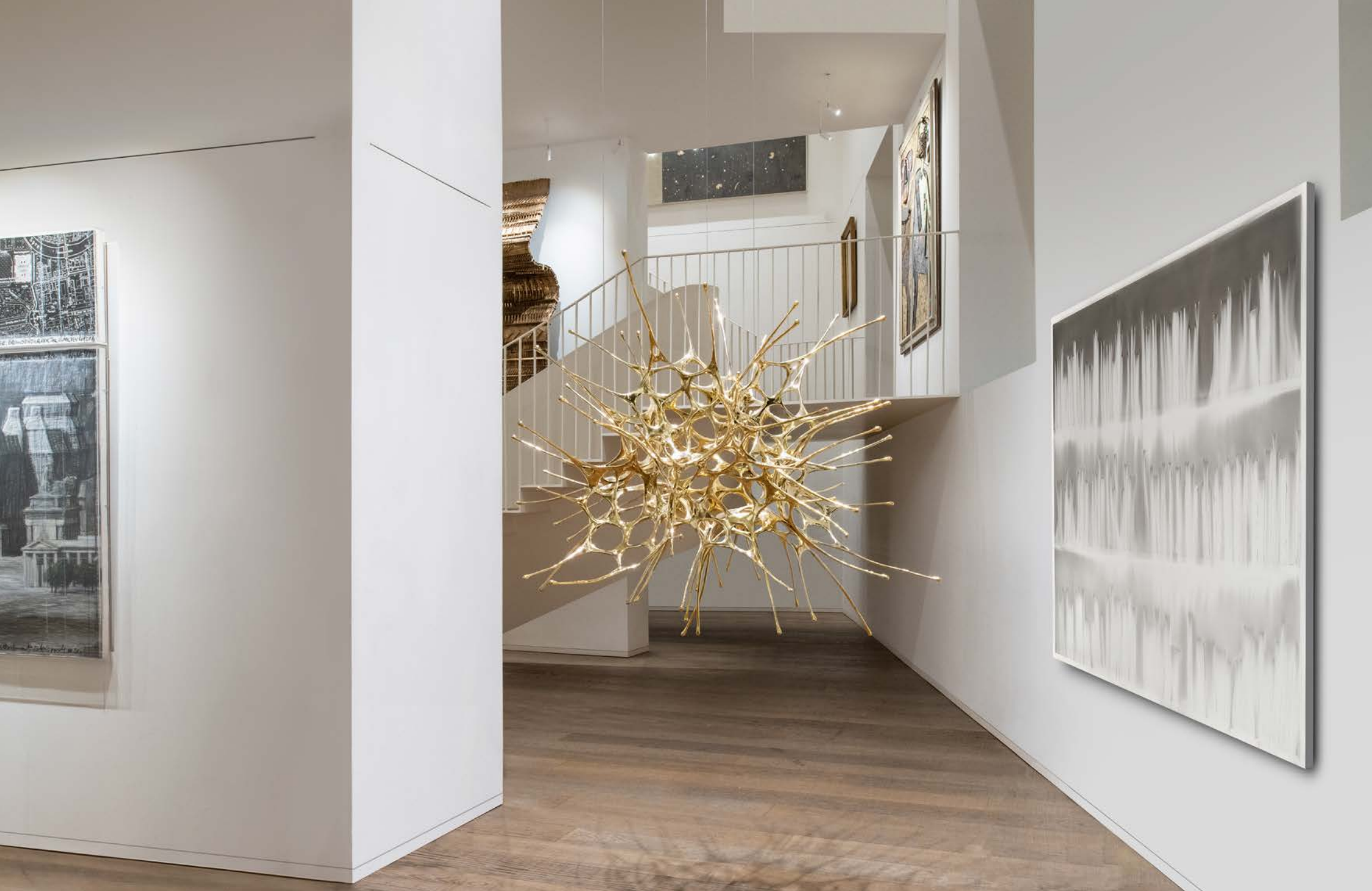
Dragon, art's heartbeat