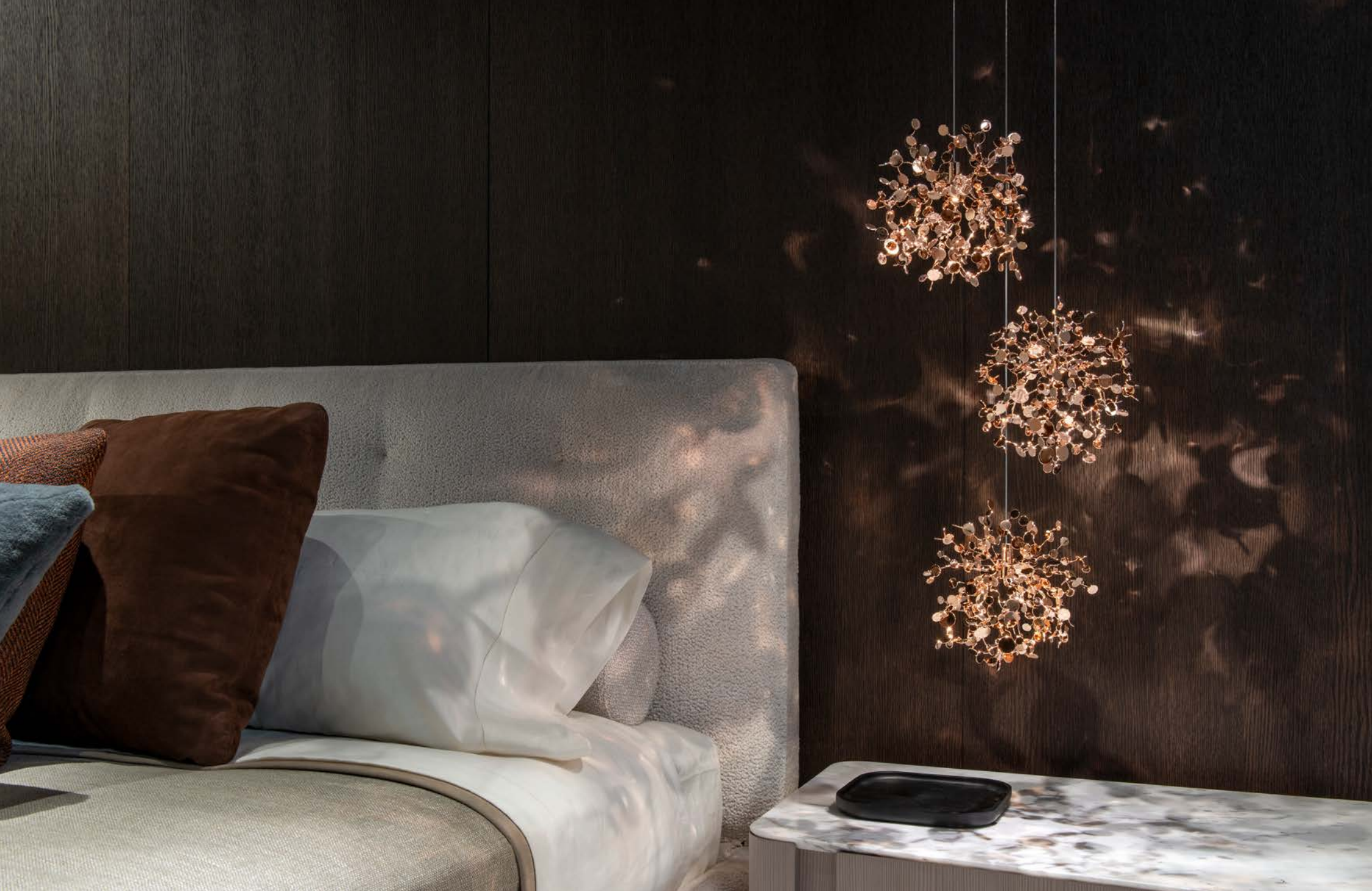
Argent, mon bijou