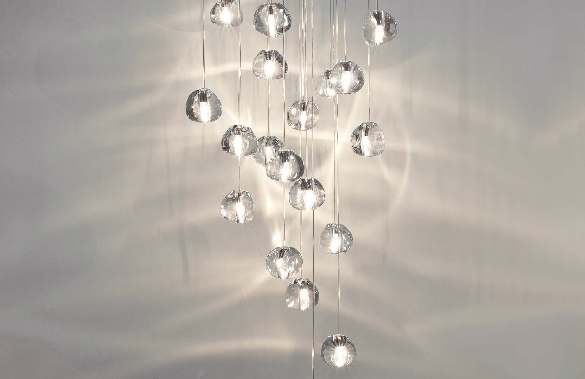
Mizu, flowing light