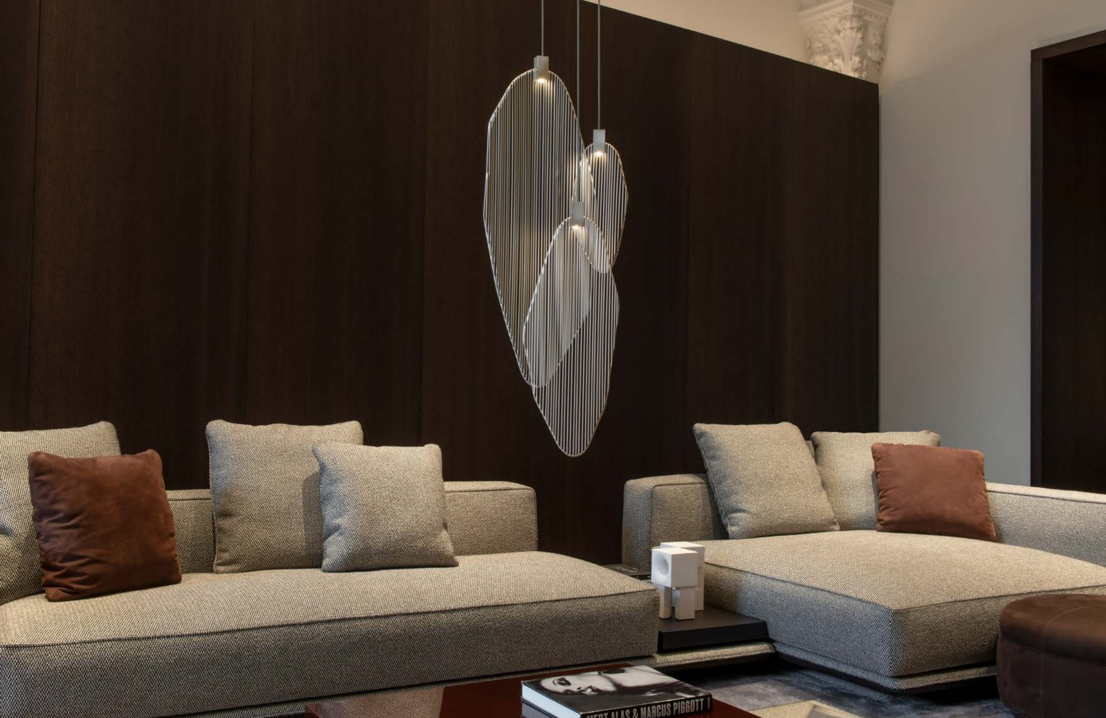
Harpe, the sound of light