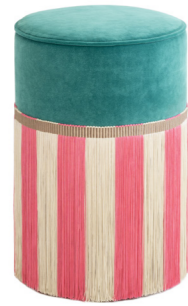
SKU : RIGA 001 30