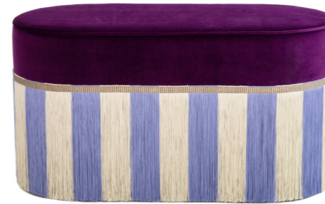
SKU : RIGA 007 85