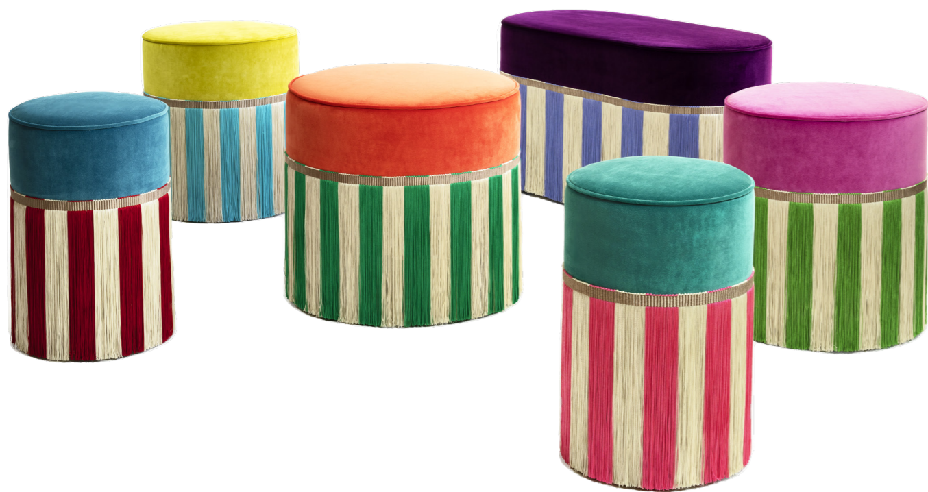
Lorenza Bozzoli Couture /New Riga Collection

We have always used high quality materials and employed skilled artisans to create these masterpieces, ensuring that the customer receives a product that exceeds his expectations in terms of both style and quality. The entire collection, made to measure and customizable upon request, allows architects and interior designers maximum creative flexibility in the idealization of space.