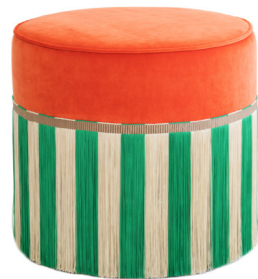
SKU : RIGA 005 50