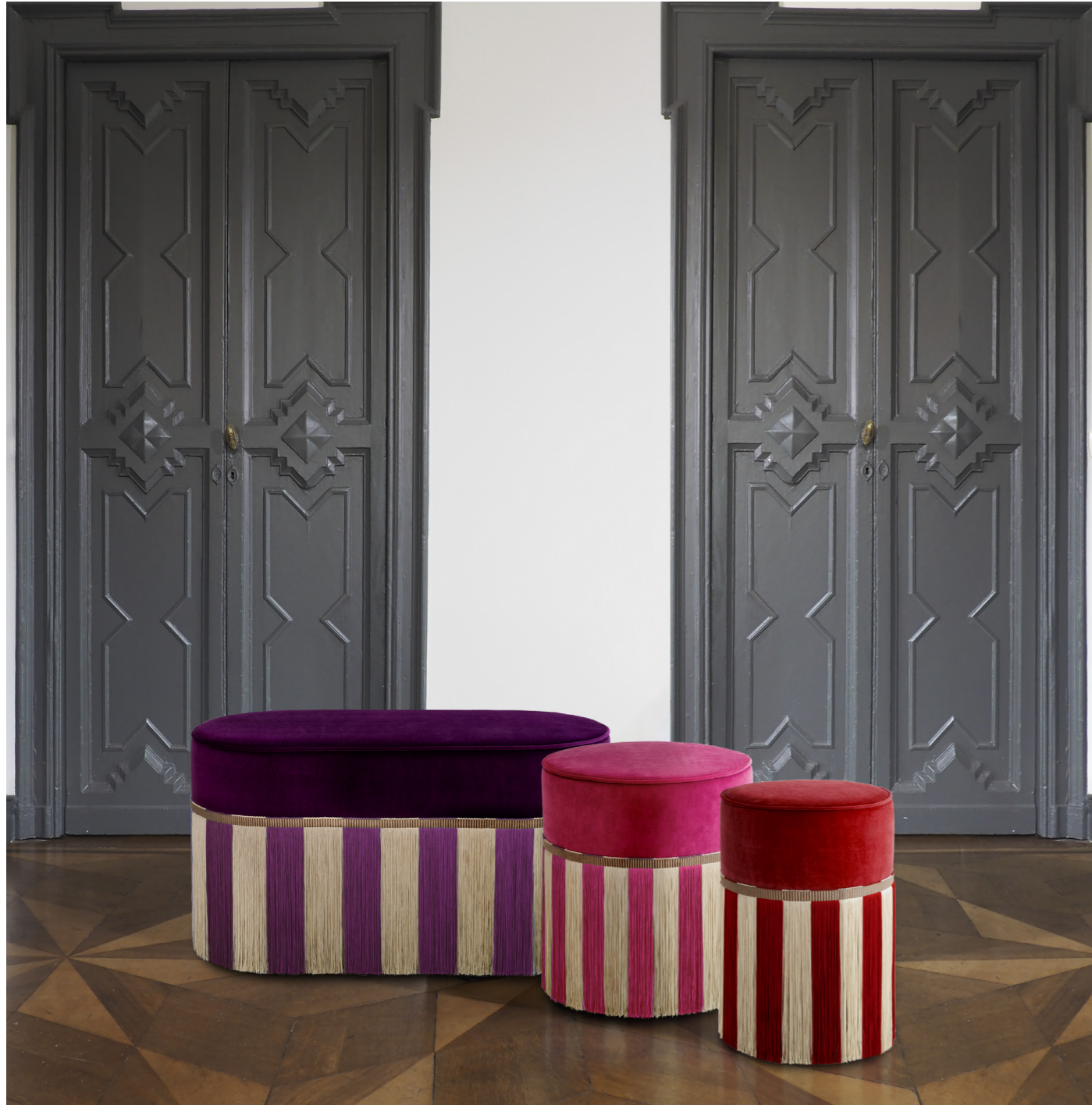
On this page three variant of a possible two-tone combination of poufs RIGA .

Lorenza Bozzoli Couture /New Riga Collection