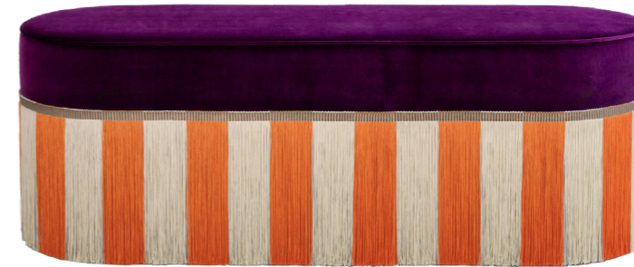
SKU : RIGA 008 130