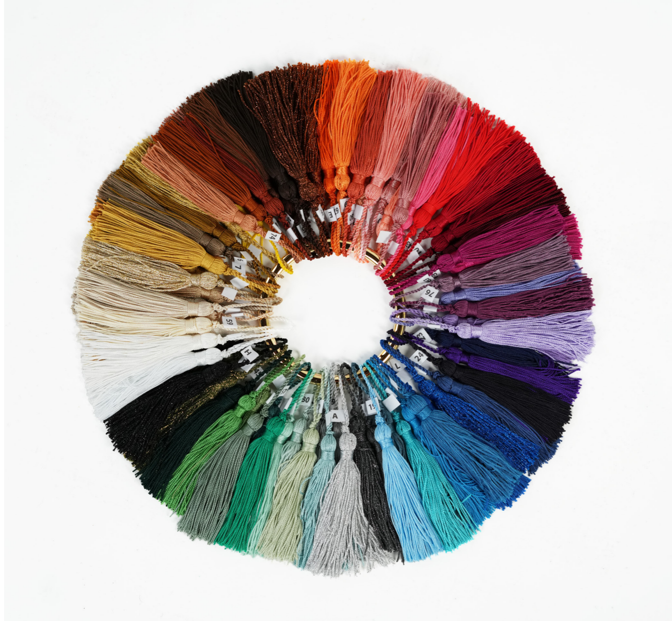
Lorenza Bozzoli Couture /New Riga Collection