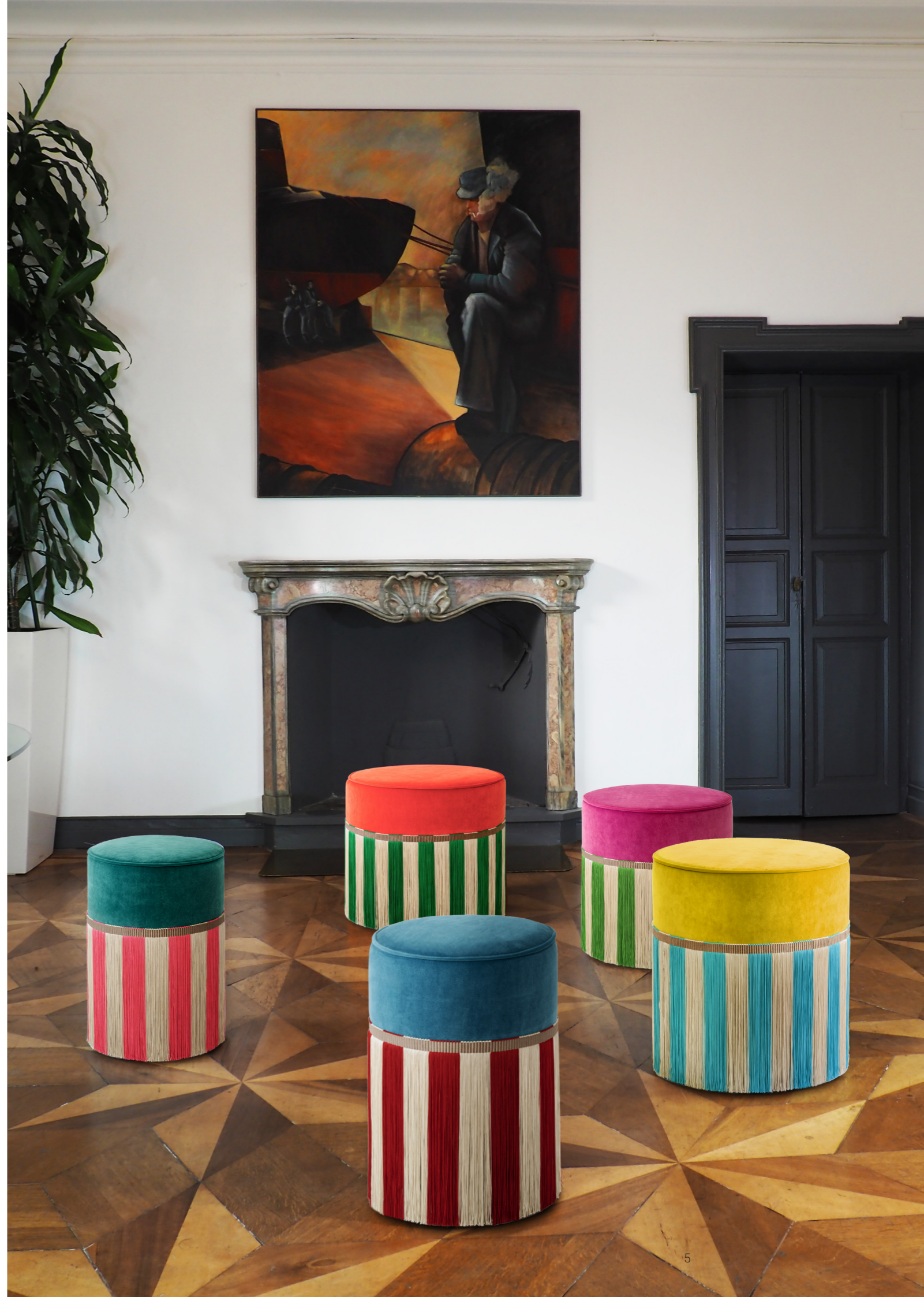
On this page, pouf RIGA with diameter 30cm. On the right page an overall of th new RIGA series

Lorenza Bozzoli Couture / New Riga Collection