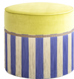
SKU : SKU : RIGA 006 50