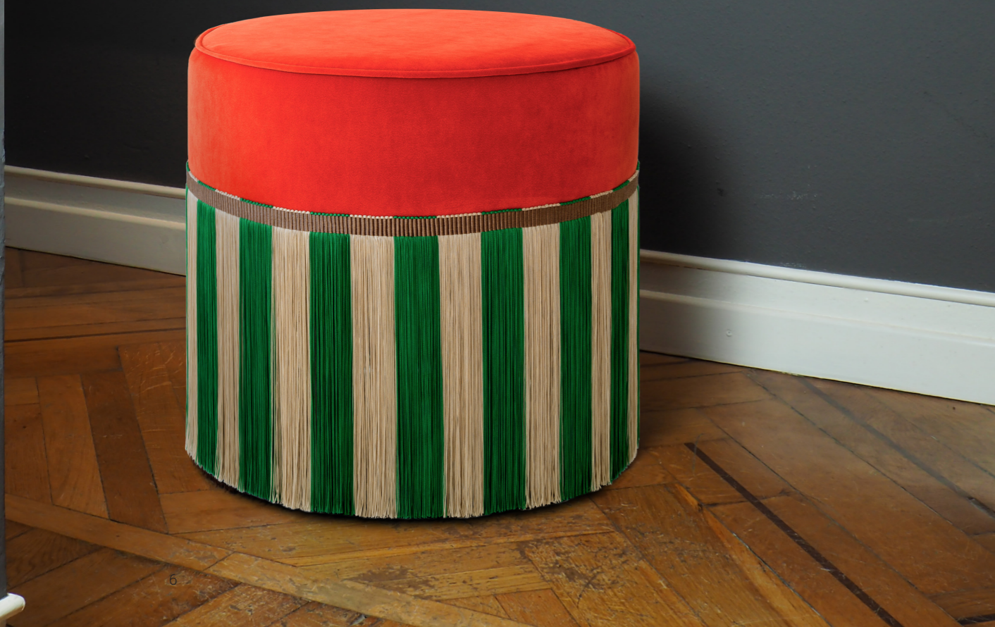
Lorenza Bozzoli Couture / New Riga Collection