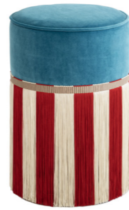
SKU : RIGA 002 30