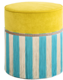
SKU : RIGA 003 40