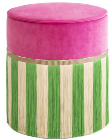
SKU : RIGA 004 40