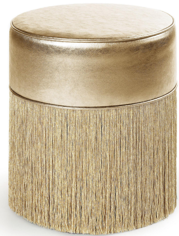
On this page, GLEAMING pouf 40 ø cm in gold metallic leather.