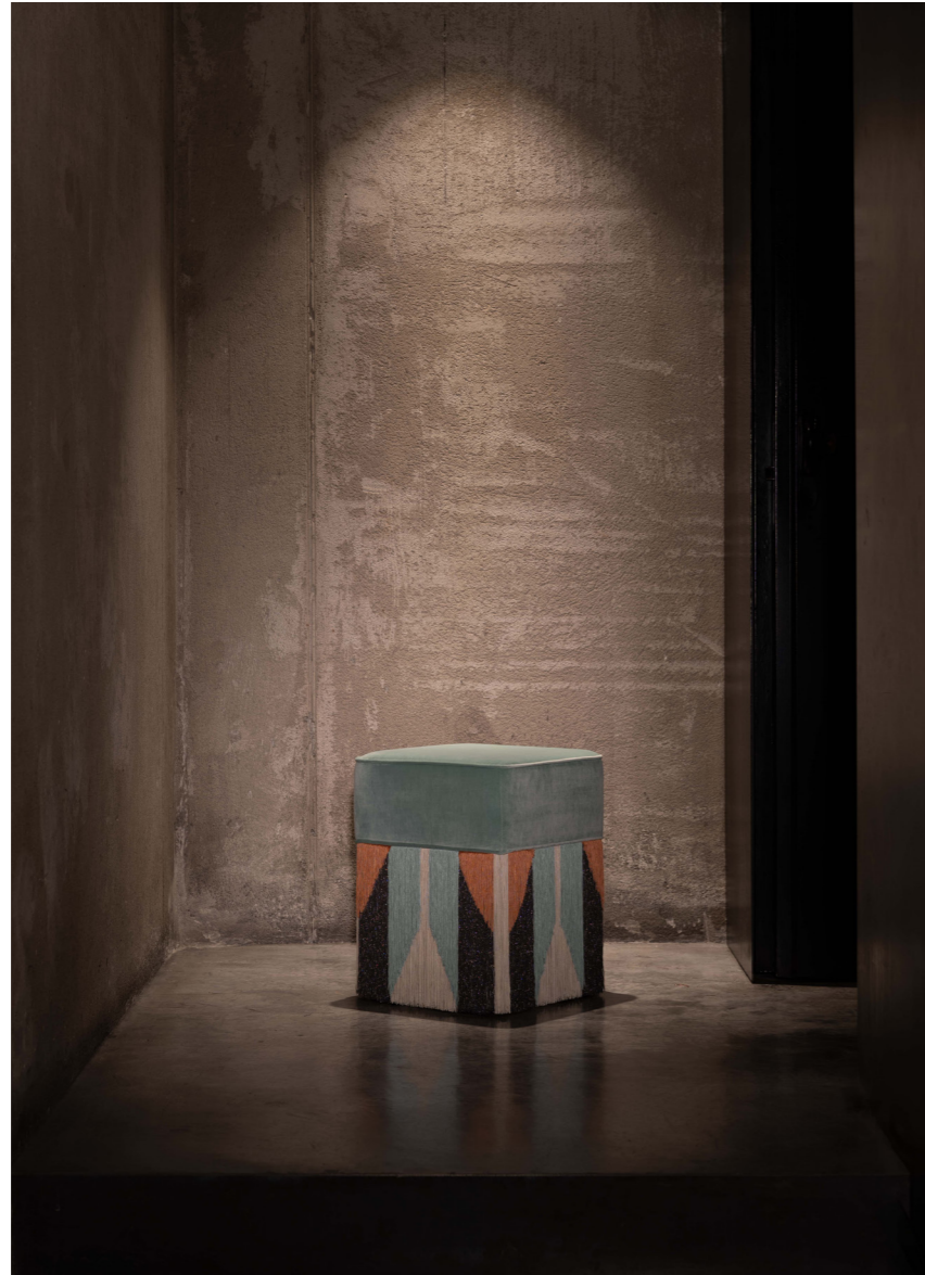
On this page, TRIBE squared pouf with a size of 35x35 cm. On the right page, TRIBE squared bench with a length of 70cm and depth 35 cm.