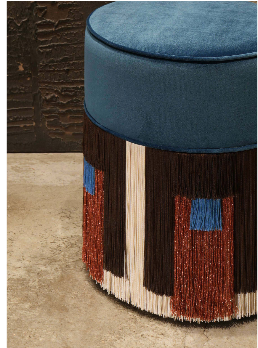
On the left page, CLEO pouf 40 Ø cm.