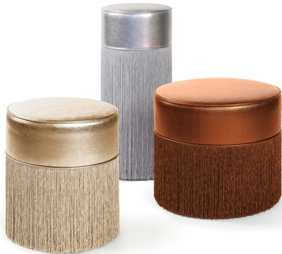
On this page, from the left, GLEAMING pouf 40 Ø cm, in light gold metallic leather, GLEAMING stool 30 Ø cm, in silver metallic leather, GLEAMING pouf 50 Ø cm, in copper metallic leather.