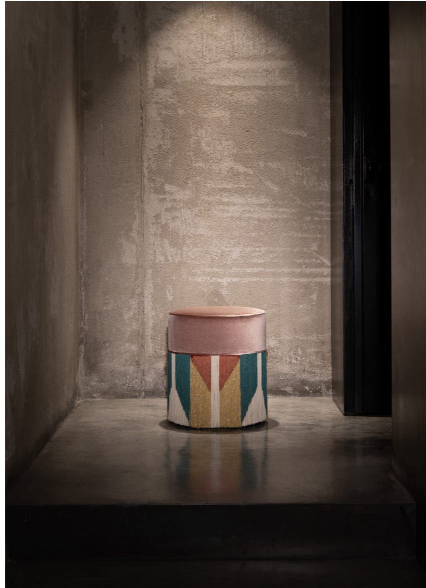
On this page, TRIBE pouf 40 ø cm. On the right page, TRIBE bench with a length of 85 cm and depth 40 cm.