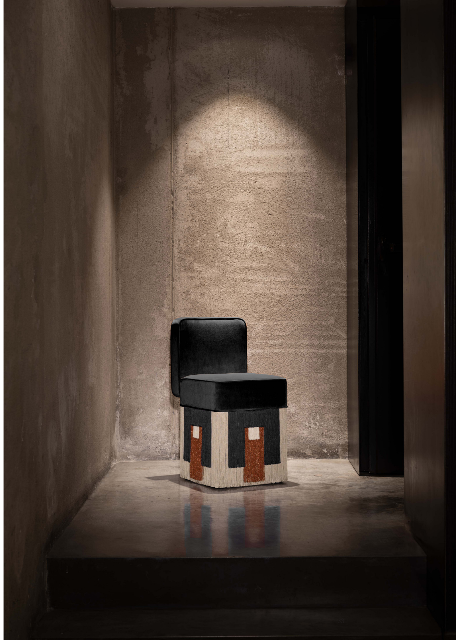
On this page, the new Lilli chair with CLEO geometries.