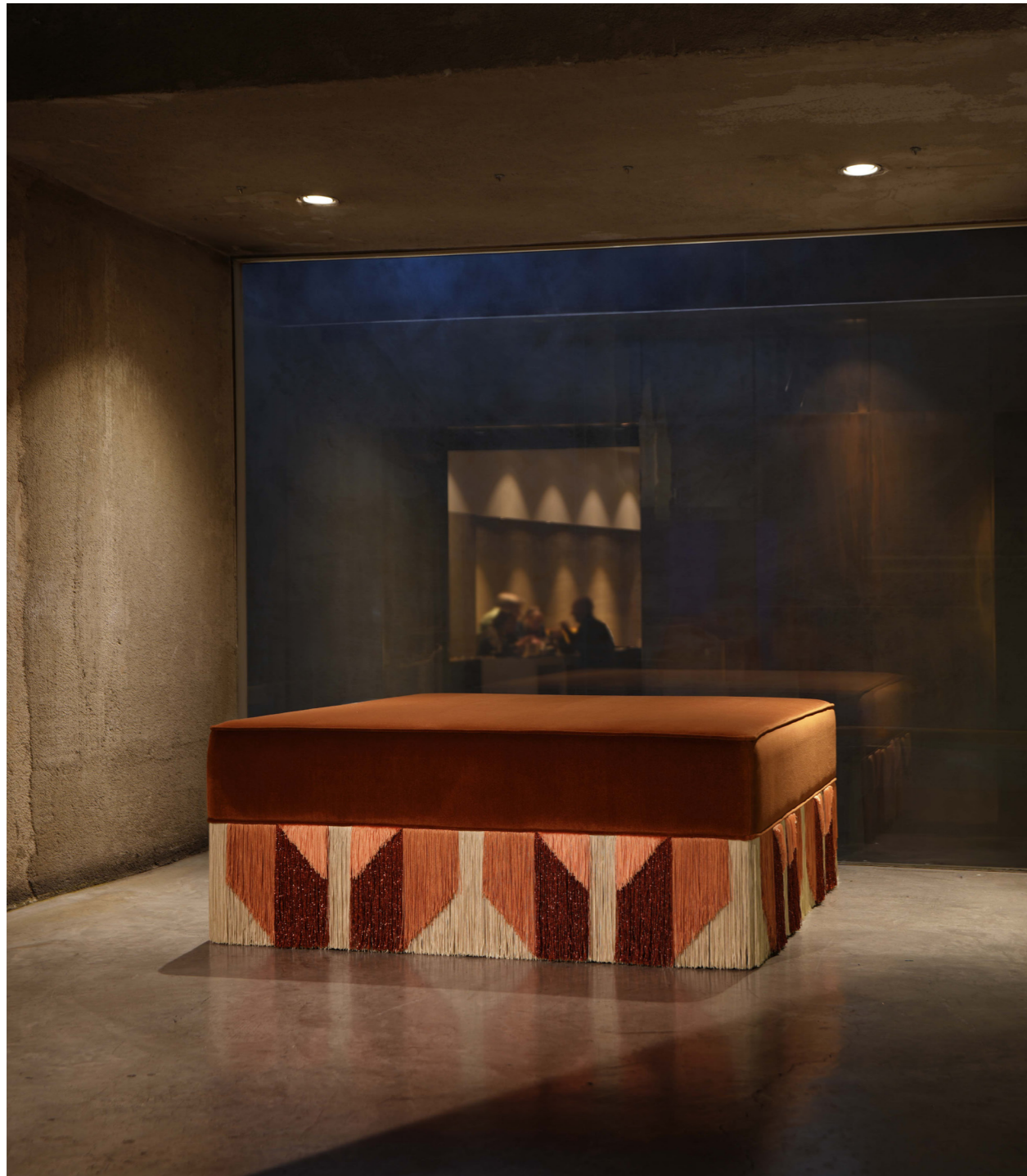
On this page, TRIBE squared pouf with a size of 95x95 cm.

The Treasure Collection proudly unveils its latest masterpiece, an evolution from its predecessor, the large ottoman. Measuring at a width of 95 centimetres, this new design transforms from a circular to a square shape, perfectly complementing the cubic silhouette of the newly introduced Lilli chair. Inspired by the iconic geometric lines characteristic of Art Deco, this square, linear ottoman becomes a pivotal element of the Treasure Collection. Its size and form make it incredibly versatile, serving not only as an extension to a linear sofa, transforming it into an L-shaped seating arrangement for added comfort but also, when positioned slightly apart and topped with a tray, as an elegant coffee table. Here, it stands ready to display your beverages, books, or decorative items, enhancing the allure of your living space. True to our tradition, this pouf offers customization options, allowing you to select from an array of fabrics and fringe designs from our extensive archive.