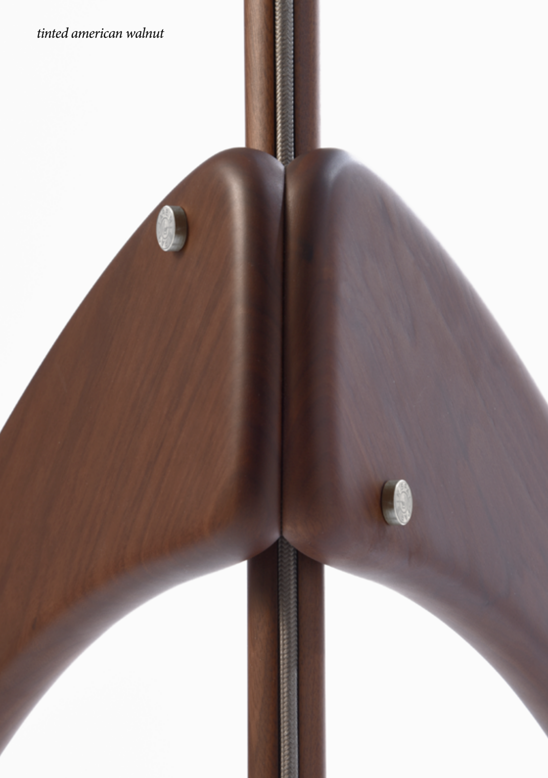
tinted american walnut